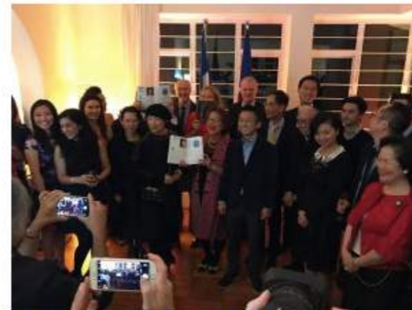
Lancement de "Those Who Inspire Hong Kong" le 26 novembre 2016 à la Résidence de France

Dans l'objectif d'inspirer les jeunes gens de certains pays, la série de « Those Who Inspire » regroupe des histoires des personnalités qui ont contribué au succès du Nigeria, Oman et des Émirats arabes unis. La dernière édition de « Those who inspire » est consacrée à Hong Kong et a été lancée le 26 novembre.