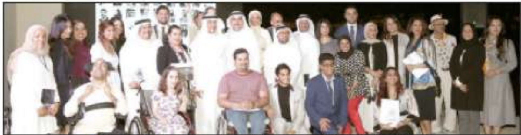
■ Some of the influential Bahraini personalities and guests during the launch of the book