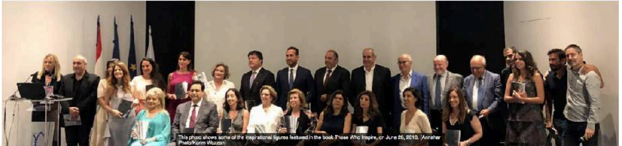
This photo shows some of the inspirational figures featured in the book Those Who Inspire , on June 20, 2010.